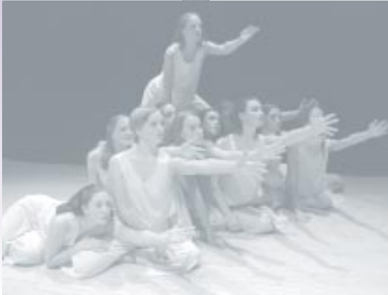
Teen dancers from the Moving Company's Northern Lights Dance Ensemble, Keene, NH perform at the 2002 Arts in Education Conference. The conference theme was "The Choreography of Learning."